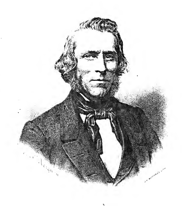
Ful, Your Freud, Ceorge B. Cheever